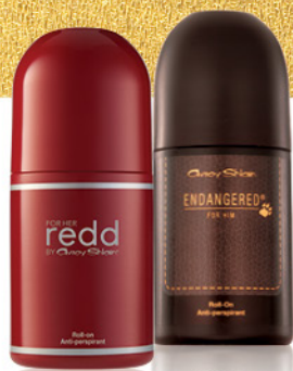
Roll-on Anti-Perspirants 50ml (Redd® by Avroy Shlain for Her & Endangered® for Him)

Place your 1 st INVOICED ORDER to the value of R750/N$840 within 2 weeks of registration and you will receive