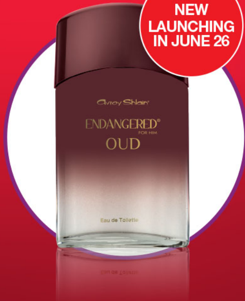
Endangered For Him Oud EDT 100ml