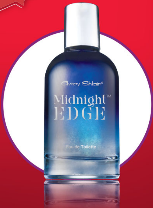
Midnight Edge EDT 100ml