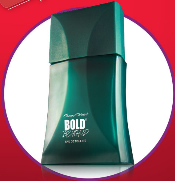
Bold Beyond™ Eau de Toilette Fragrance 75ml

Excluding Zimbabwe, Mozambique and Namibia